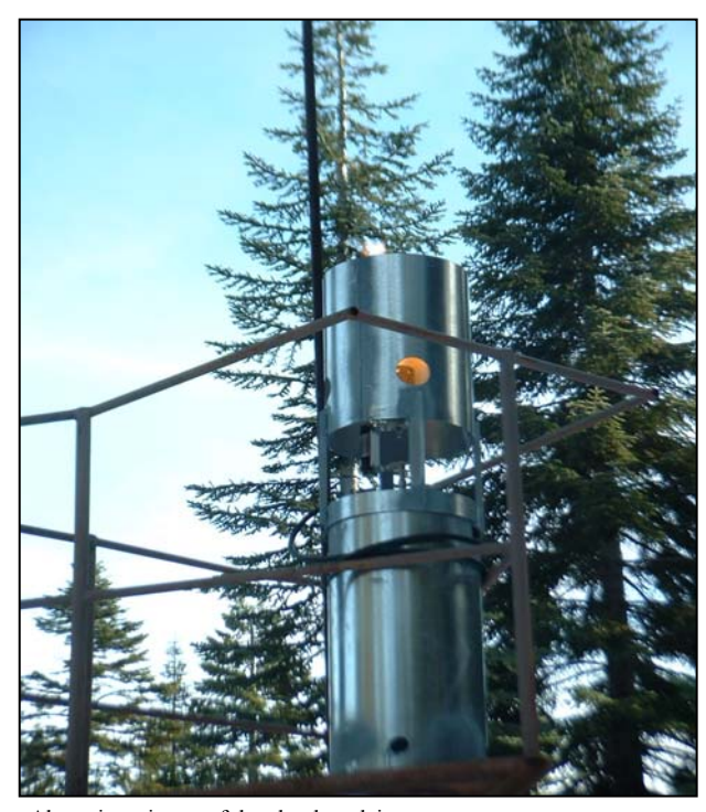
Above is a picture of the cloud nuclei generator.

Even though there are similarities when comparing snow pack augmentation to rain enhancement, they are very different things. The same type of material is used to seed the cloud but the mechanics of getting this material to the right part of the cloud is very different. In Texas, cloud seeding is done during unstable conditions where thunderstorms blossom. Snow fall is very different, in that it exists in a fairly stable weather situation. The updrafts that are critical in summer time thunderstorms do not exist when seeding a snow storm. As well, seeding is not only done by aircraft, it is also done by a network of cloud nuclei generators (CNG's) which are located in the higher terrain of the target area. As well, thunderstorms last on the matter of hours, where snowstorms can last on the order of days. The project staff was made of a project